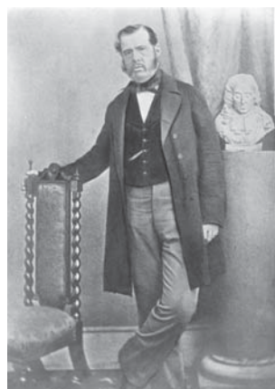
Frederick Barlee Courtesy State Library of Western Australia, The Battye Library 1905B/6