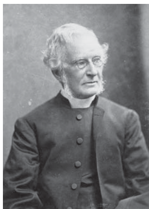
Bishop Hale Courtesy State Library of Western Australia, The Battye Library 267B