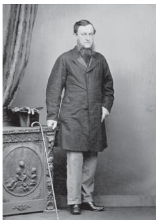
Reverend CG Nicolay Courtesy State Library of Western Australia, The Battye Library 4976B/22