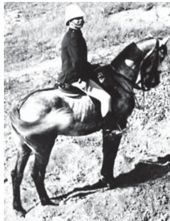
Claremont constable, 1902 Courtesy State Library of Western Australia, The Battye Library 3055/B31